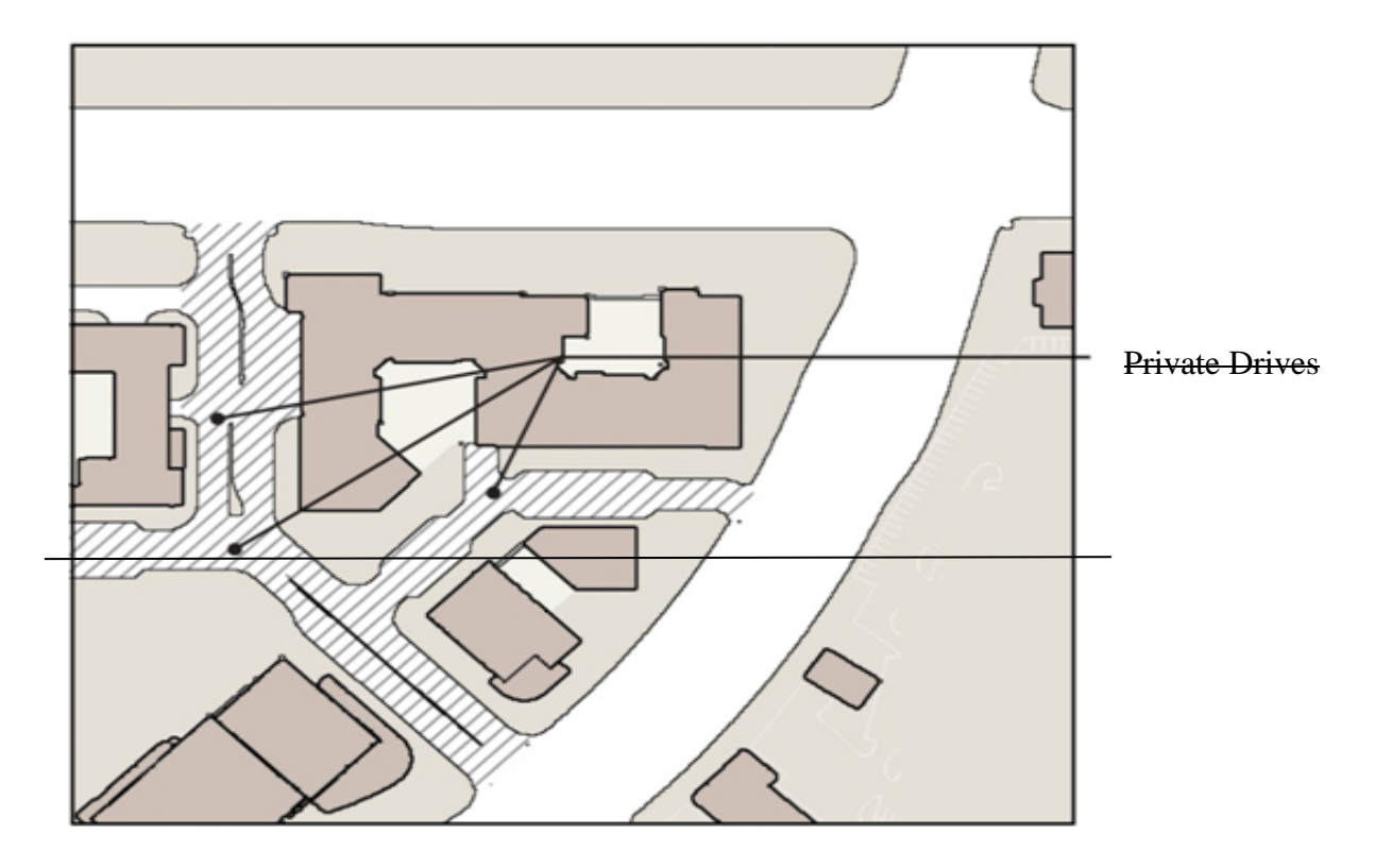
Diagram 153-03E Typical Private Drives

CLN:dkr:mm 06/08/16 06/13/16 COR. COPY 06/21/16 COR. COPY 2 Or.Dept:DSD Doc. No.: 1284974_3